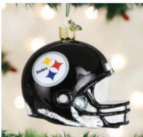
Pittsburgh Steelers Helmet Ornament