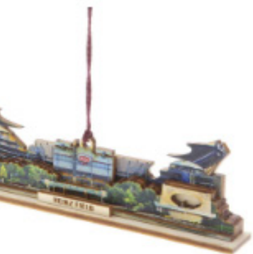
h z Stack Wooden Ornament