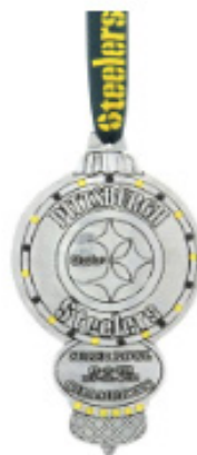
Pittsburgh Steelers Collector's Edition Ornament with