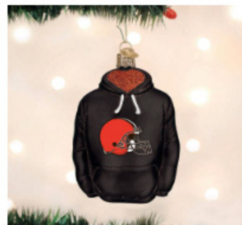
Cleveland Browns Hoodie Ornament